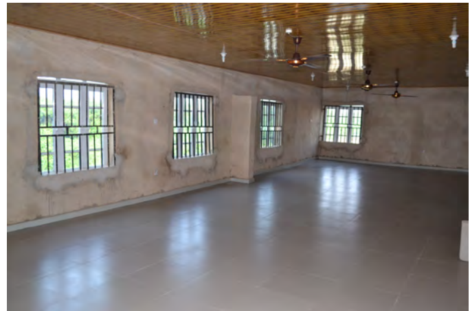
LEVEL TWO FASHION AND DESIGN