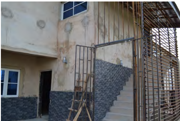
REAR GATED STAIRWELL

Two stairwells in the front of the building allow for entrance and exit to the upper reception room. Both the stairwells and the reception room will be guarded and only registered participants will be allowed to enter the second level. An additional gated exit is available through the break room on this same level.