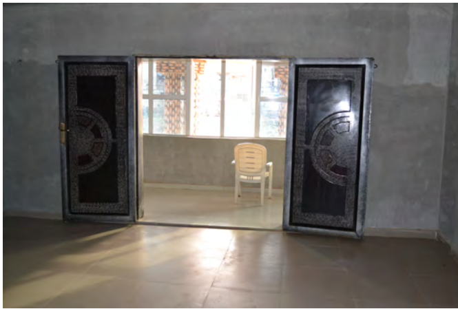
LEVEL TWO RECEPTION AREA