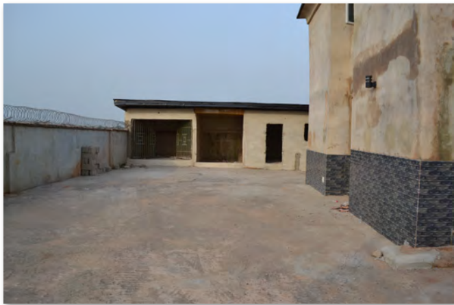
STORAGE AND GENERATOR ROOMS