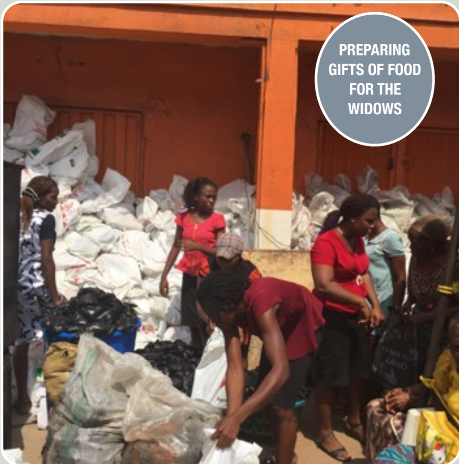
PREPARING GIFTS OF FOOD FOR THE WIDOWS