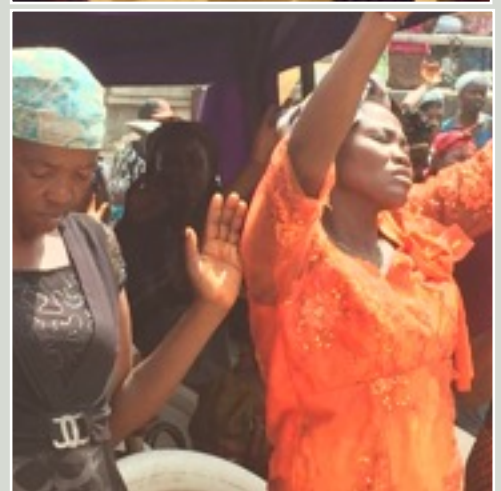
WORSHIPPING OUR LORD